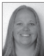
ADMINISTRATIVE ASSISTANT 3RD SEASON