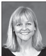
ASSOCIATE COMMISSIONER 28TH SEASON