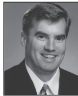
ASSISTANT COMMISSIONER 13TH SEASON