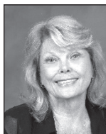
ADMINISTRATIVE ASSISTANT 24TH SEASON