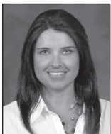
ASSOCIATE INFORMATION DIRECTOR 6TH SEASON